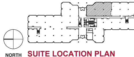
SUITE LOCATION PLAN