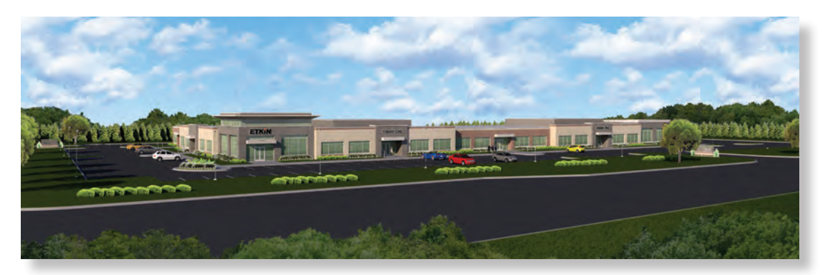
Distinctive landscaping features include a stream that winds around the north side of the property.

The current design of Victor East may be modified and built-to-suit for a major tenant. Options are available for a screened loading area with overhead doors per tenant requirements. Space may be easily divided for multiple users with each suite highlighted by a distinctive decorative entry. Clear height ceilings of 13+ feet increase options for planning along with additional corner offered by the unique U-shaped building design. High standards and finishes throughout including energy efficient lighting, HVAC system and the building envelope.