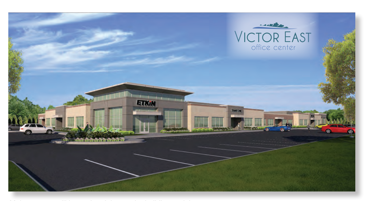
Major tenants will have sign rights on the building and the entry monuments on Victor Parkway and 7 Mile Road.

Livonia's I-275 corridor is hot. As the amount of available space continues to drop, rents have begun to climb. Since Etkin is among the few long-term local developers with a shovel-ready site of this quality, many real estate insiders feel that a major pre-lease deal could be right around the corner. "The Victor East site is just amazing, 6.36 acres on a vibrant insertion like this is hard to find in today's tight development market. The highly flexible, 54,000 SF footprint is ideal for many mid-size suppliers who want to be located at the epicenter of the world's major automotive manufacturers. Healthcare and industry suppliers are also drawn to this thriving location," commented Suardini.