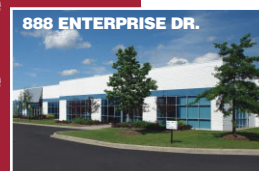
888 ENTERPRISE DR.