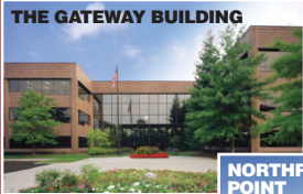
THE GATEWAY BUILDING