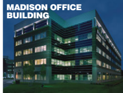
MADISON OFFICE BUILDING