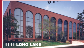
1111 LONG LAKE